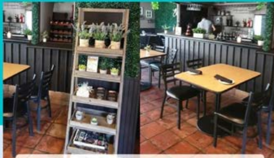
LA NORMA ITALIAN RESTAURANT

They have recently refurbished the indoor dining area because – they say – it lacked a bit of ambiance and now they are trying to recreate the atmosphere of a typical Italian "piazza" on their patio. The restaurant also offers live music nights and – they promise – with the right weather those evenings are quite magical.